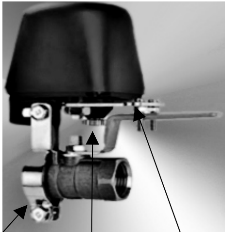
Metal Fixing Bracket Manual Reset Button Metal Control Arm

The Actuator has a Metal Control Arm which is secured around the Lever of the valve by 2 screws (provided). During installation ensure that the Actuator is secure and that the Manual Reset button is accessible. Tighten the 2 screws which secure the Arm to the Valve Lever. Connect the power supply lead from the Actuator to the Control Panel.